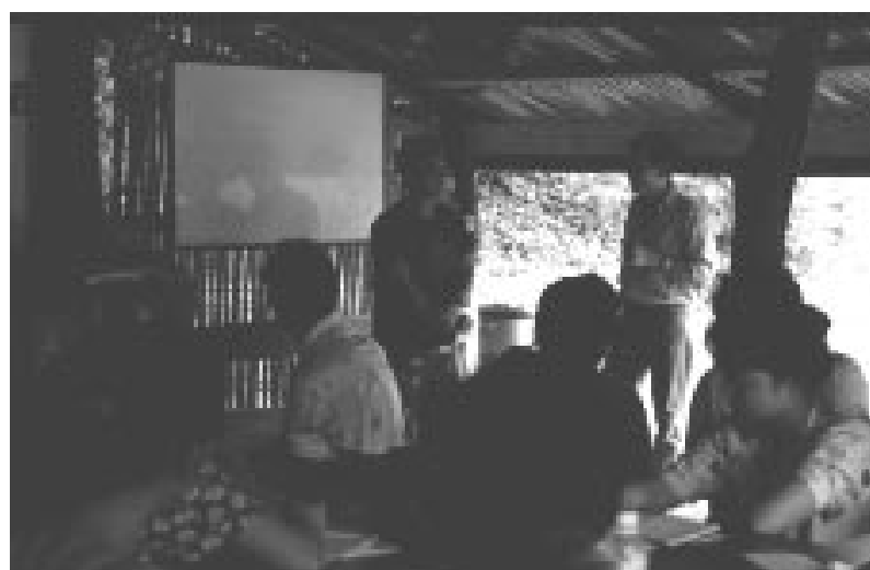
Training session on Community Management of Protected Areas as part of the activities of the Regional Community Forestry Training Centre (RECOFTC) in Thailand. Training includes field activities, in this case in Chalerm Rattanakosin National Park.

Such large scale damage of protected areas should be seen in a context of widespread deforestation, desertification, range degradation, depletion of wildlife populations, or other environmental deterioration, over much of the land and marine area of many countries. There have also been important changes in the hydrological regime of major rivers, with many consequent environmental changes, including widespread dieback or removal of important natural habitats. These escalating environmental trends are linked to population growth and aspects of economic development, or to responses to these. In many countries there are also very serious management obstacles posed by recession, war, insurgency, corruption or drug trafficking. As an example, during early 1995 in just four of the countries of Central America, 42 park personnel were killed on duty when their work brought them into contact with illegal drug and mining activities.