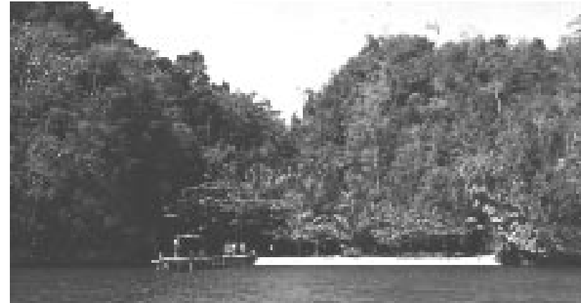
Los Haitises National Park (Category II), in the Dominican Republic.