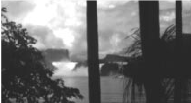
Canaima National Park (Category II) and World Heritage Site, Venezuela.