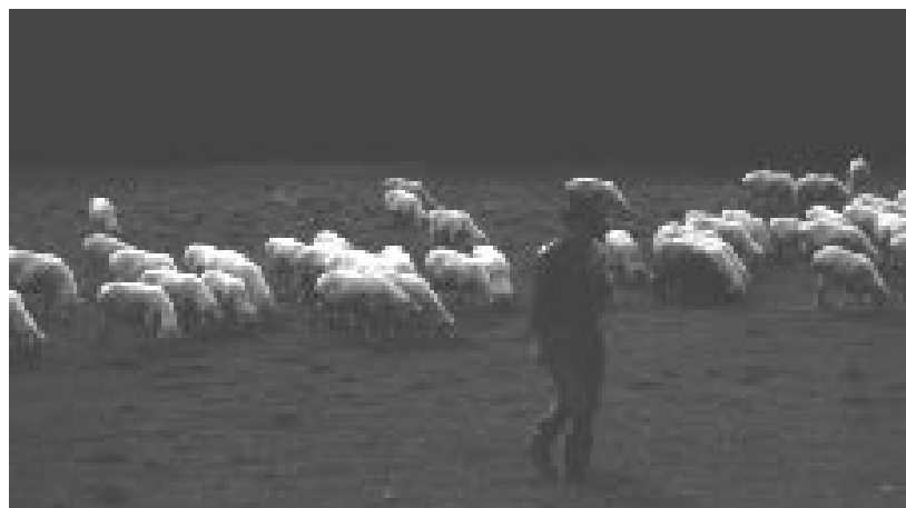
Traditional practices, such as pastoralism, are allowed under buffer zone management in the Tatra Biosphere Reserve, Poland.

about existing protected areas. Biophysical information needs to be complemented by appropriate social and economic data.