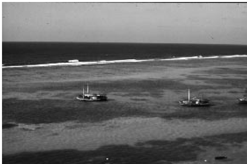
Under the zoning system of Desembarco del Granma National Park, Cuba, there is provision for a Marine Protected Landscape (Category V) in the zone of Cabo Cruz, where traditional and limited commercial fisheries are allowed.

Most countries have a considerable number of protected areas. Overviews of the range of units, their management classification and status are available at global or