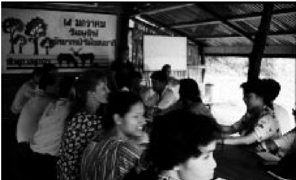
Community-based protected area management training session in Chalerm Rattanakosin National Park, Thailand.