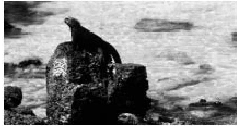
Galapagos National Park (Category II) and Natural World Heritage Site, Ecuador.