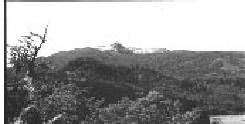
Lanin National Park (Category II), Argentina.