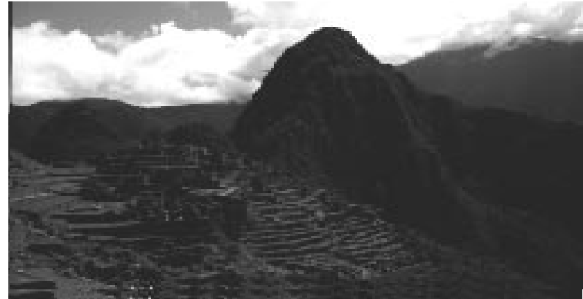
Machu Picchu Historic Sanctuary (Category II) and World Heritage Site, Peru.