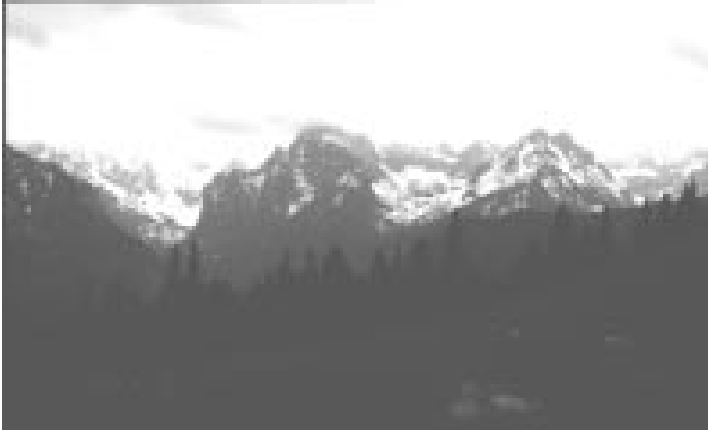
Tatra National Park (Category II) and Biosphere Reserve in Poland.