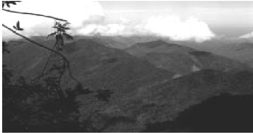
The Great National Park Sierra Maestra (Category VI) include a number of different protected areas under different management categories and allow productive zones for the use of natural resources, which mainly include forestry, coffee plantations, tourism and recreation.