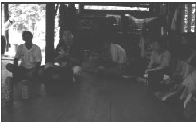
Training session on social assessments and discussions with one of the elders of a Karen minority, close to Chalerm Rattanakosin National Park, Thailand

Consultation should extend beyond the local community to include all important stakeholders. As part of the institutional and decision framework within which protected areas are managed, stakeholders – such as tourism operations, water and energy supply companies, and the media – are potentially very influential. Without their co-operation, the effective development of a protected area system may be