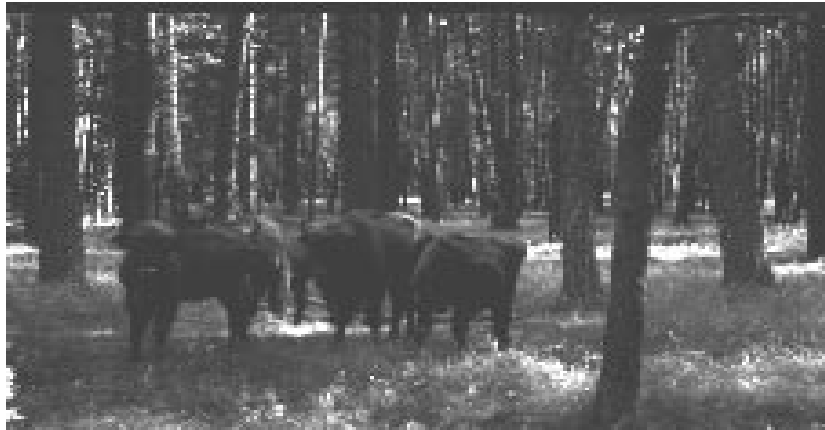
Okskiy Zapovednik (Category I) in Russia.