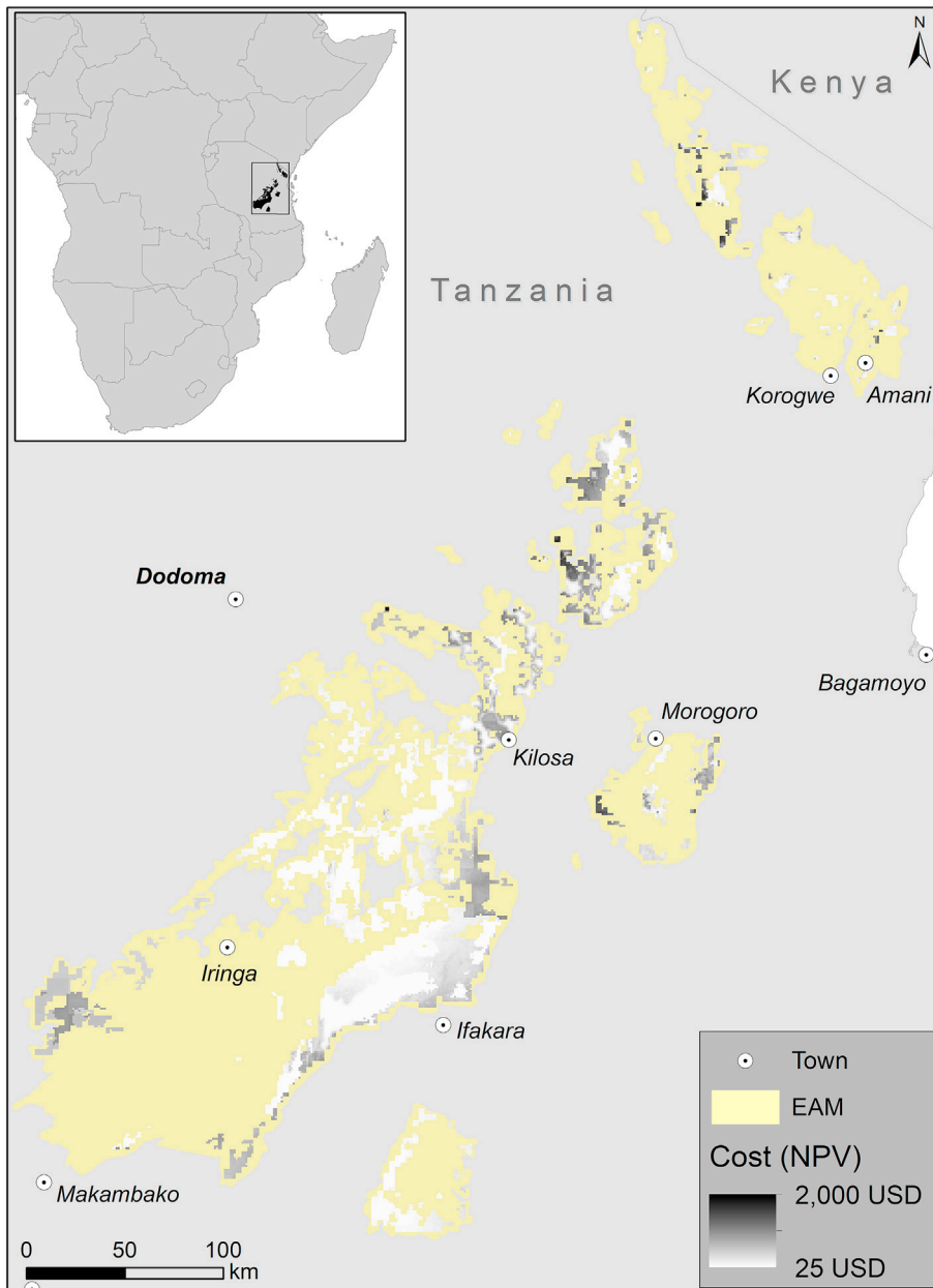
Fig. 1. Spatial variation in the costs of conserving forest and woodland in the Eastern Arc Mountains, summed for management, damage and opportunity costs (net present value, r = 15\% ). Yellow area indicates habitat other than forest/woodland within the Eastern Arc Mountains. (For interpretation of the references to colour in this figure legend, the reader is referred to the Web version of this article.)

outside of reserves and provide summaries by vegetation type (woodland and forest). We calculated the level of association between these cost layers using a Spearman-rank correlation test. We also provide results based on the existing reserve network, which we estimated using the native resolution of the analyses (Table 1). We used R 2.15.1 (R Development Core Team., 2009) and ArcGIS 10 (ESRI, 2010) for analyses. Monetised values are for 2010 USD, using an exchange rate of 1 USD = 1,450TZS.